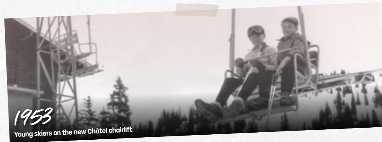
1953 Young skiers on the new Châtel chairlift

1995, Pléney opened its gondola lift to mountain bikers and built a dedicated trail. Avoriaz, Châtel, Champéry, Les Crosets, Les Gets, Morgins, Morzine and Les Crosets offer world-class Bikeparks. The UCI (International Cycling Union) has confirmed the region's appeal by organizing the Mountain Bike World Championships in Les Gets in 2004 and 2023, and in Champéry in 2011. The Swiss resort will host them again in 2025 !