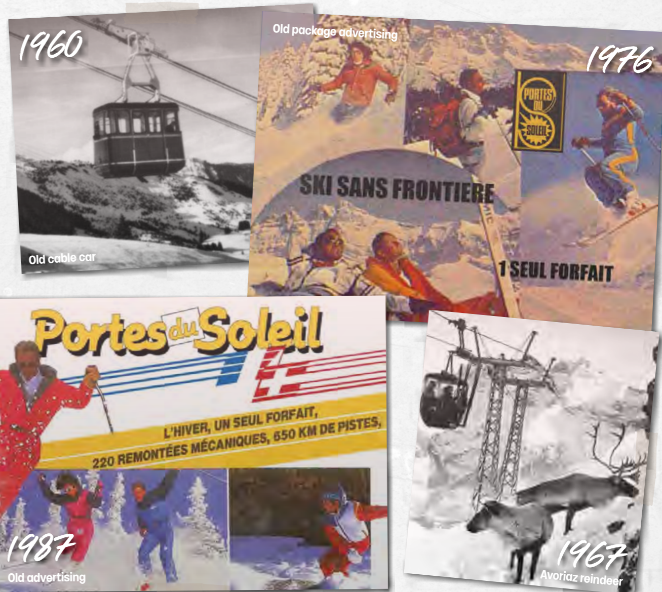
1960 Old cable car

Les Portes du Soleil, 12 resorts come together to offer skiers an immense cross-border alpine domain: 600 km of skiing accessible via 208 lifts.