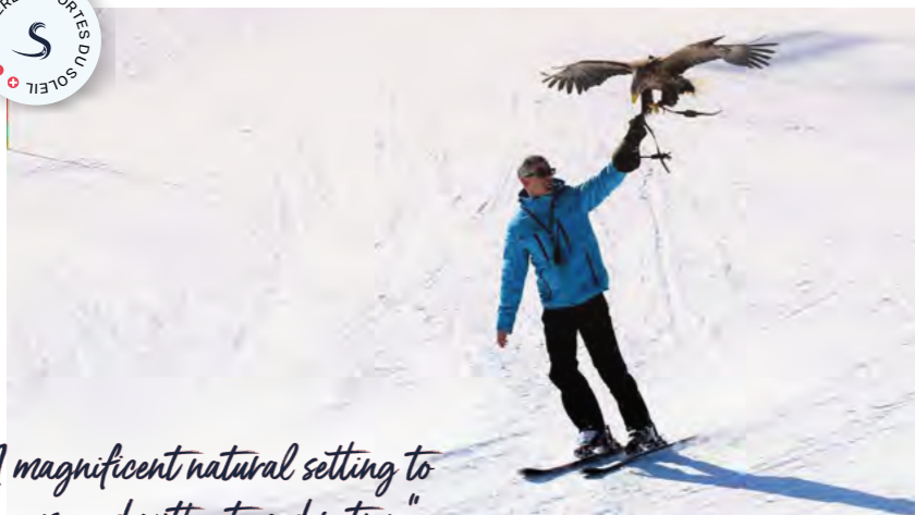
"A magnificent natural setting to be enjoyed without moderation"